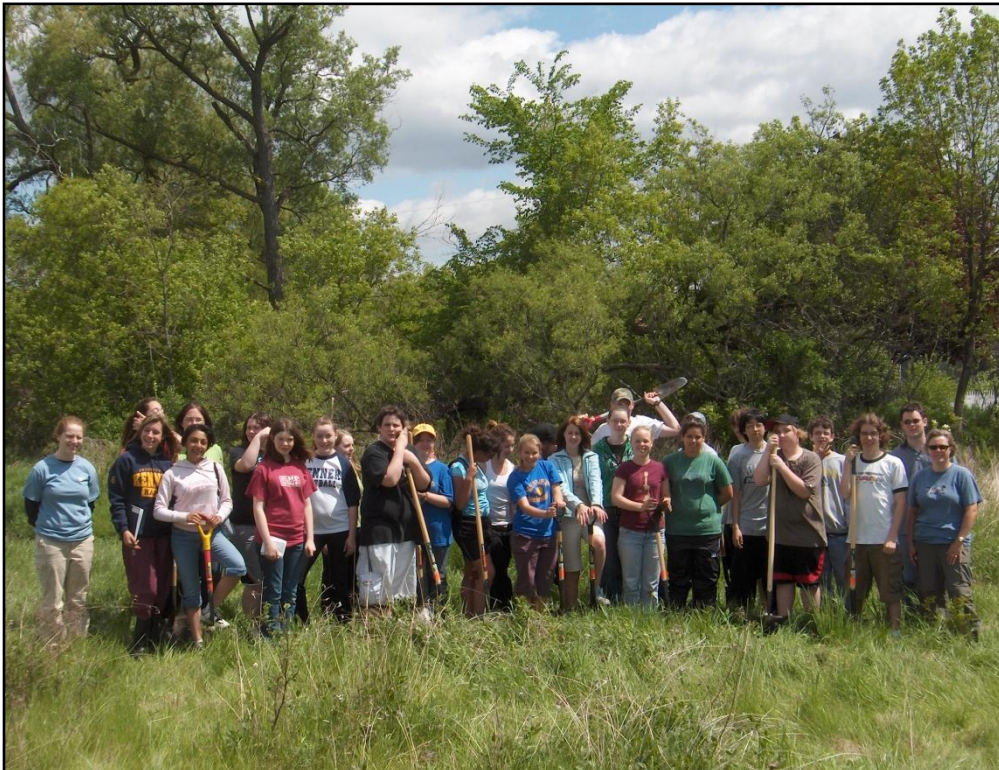
Figure 2: Group of volunteers planting on Holmes Property