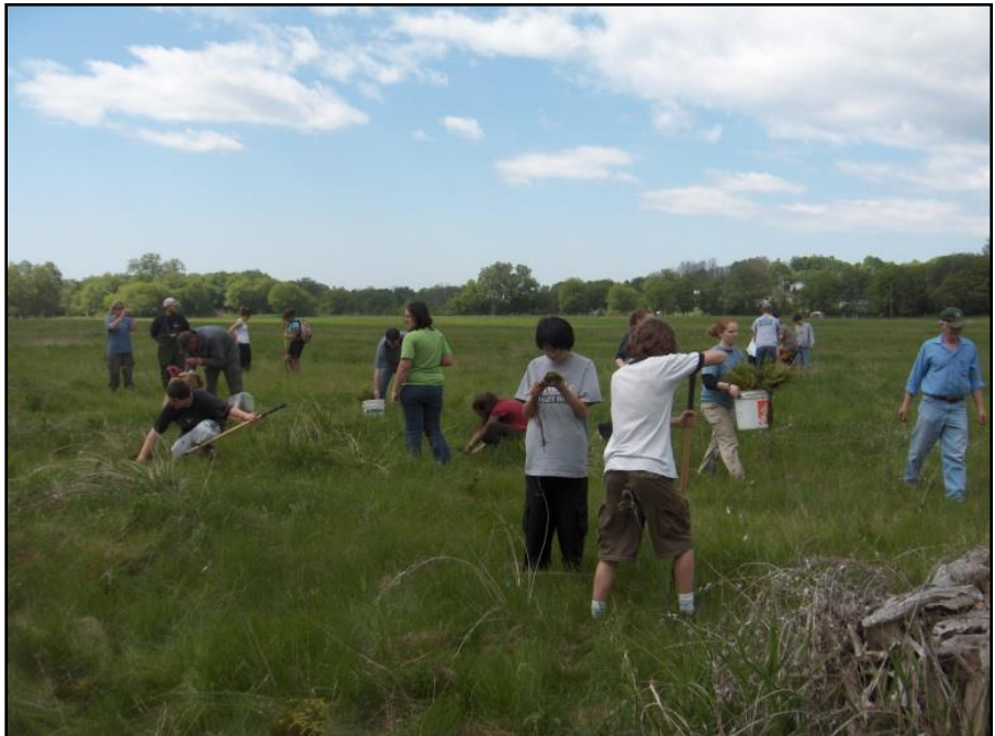
Figure 1: High school students planting white cedar on the Holmes property

The Holmes property has been the site of earlier projects, both a woody debris clean up in 2006 and a riparian planting of 2000 white cedar seedlings in April of 2007 (figure 1). Cobourg Brook dominates the southern and eastern boundaries of this property and had relatively minimal riparian vegetation. An area that was at moderate risk of experiencing bank failure was identified as a planting site. On May 28 th and May 29 th a high school and public school from the Peterborough area were engaged to assist with the plantings. Over two days two separate high school classes and a grade four class were paired up and succeeded in planting 500 white cedar seedlings. The seedlings and instruction on proper planting technique was provided by TOF. There were 71 youth volunteers and 12 adult volunteers, who put in 83 hours and planted 20,000 m 2 of shoreline (figure 2). Figure 3 is an image of the site in 2008, after the logjam removal and successful riparian planting.