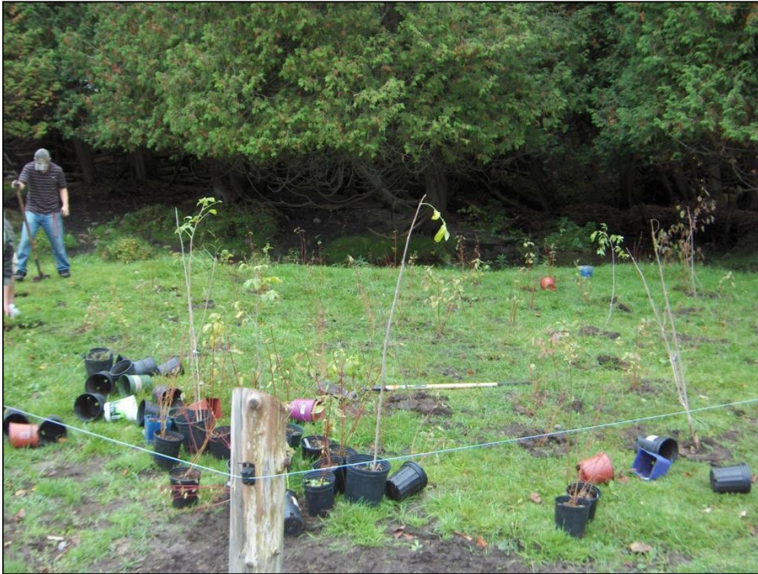
Figure 2: Volunteers planting native shrubs along stream banks and areas fenced off from cattle.