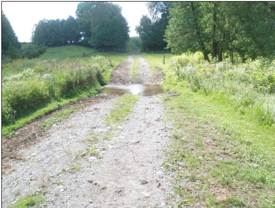
Figure 3: Spring of 2010: successful crossing for both cattle and farm equipment and vigorous riparian plant growth.