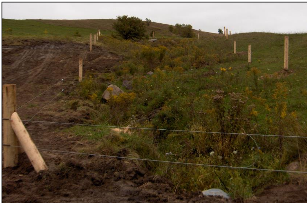
Figure 1: Fencing cattle out of headwaters to the Cobourg Brook on a farm in Cold Springs.

Cold Water, in Northumberland Township is a farming community and hosts many of the headwaters into the Cobourg Brook. One farm in the area was in need of fencing to keep cattle out of the stream and therefore an alternative water source for the livestock. In this case the cattle were trampling the creek, increasing the sedimentation into the water and also depositing waste, which increases nitrification in the stream. Approximately 100,00m 2 of habitat was fenced off for the cattle and an automatic watering device was installed (figures 2 &3). The MNR Canada- Ontario Agreement funded $3,400 of the project and the Community Stream Steward Program funded $2,000 of the project. The project was overall successful in a mission to project the coldwater habitat downstream.