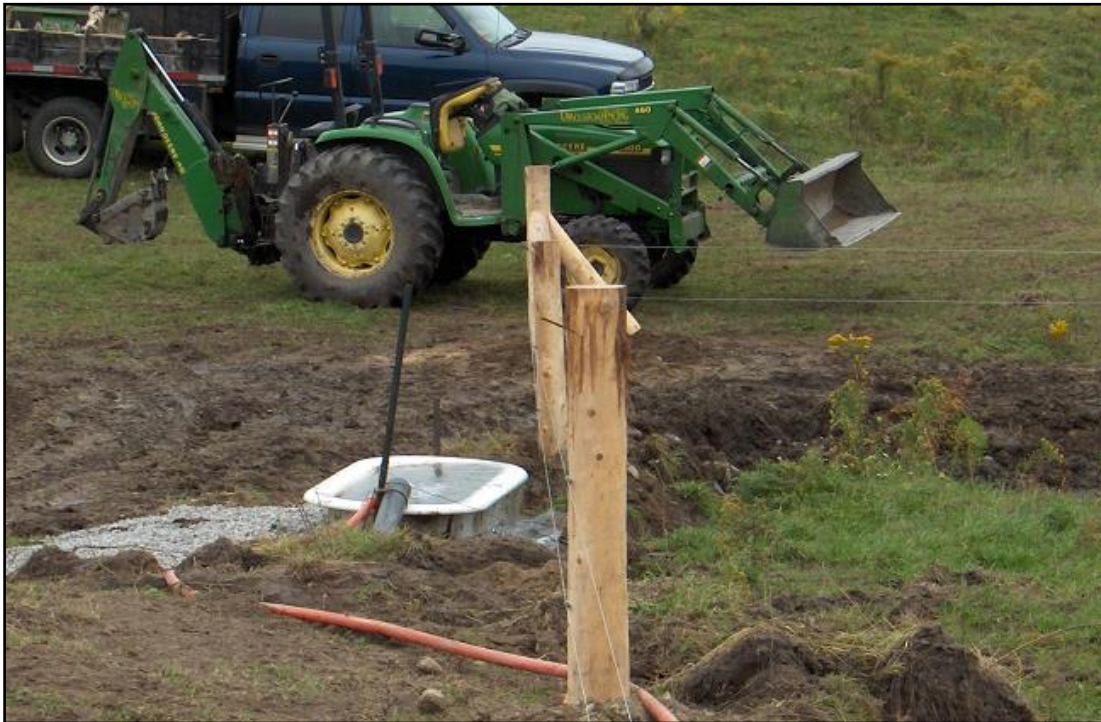
Figure 2: Installation of an alternative water source for the cattle on property.