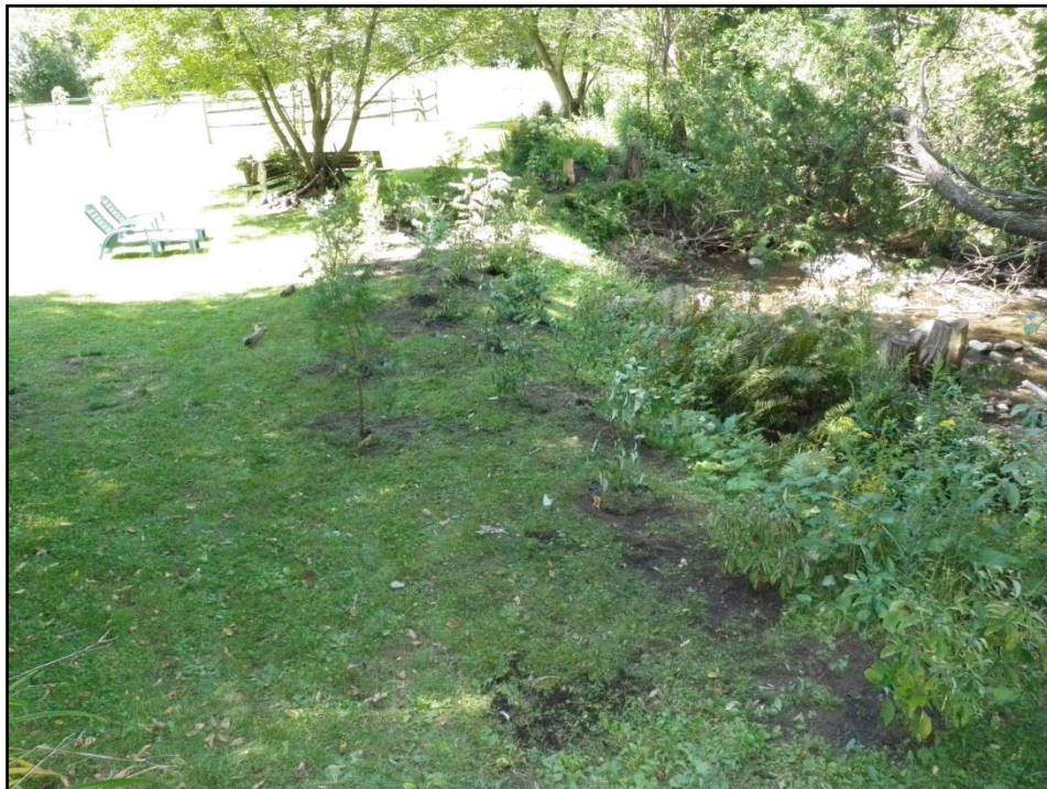
Figure 3: Completed sideline 32 planting site on Duffins Creek.