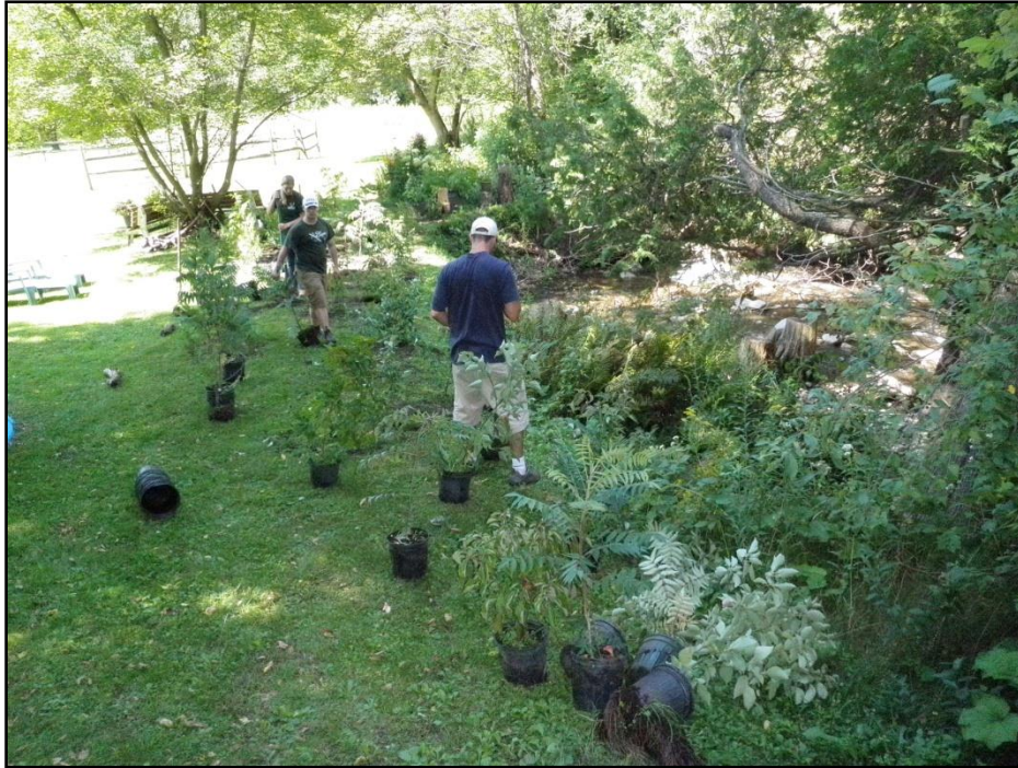
Figure 2: Volunteers from Fleming College planting shrubs along Duffins Creek.