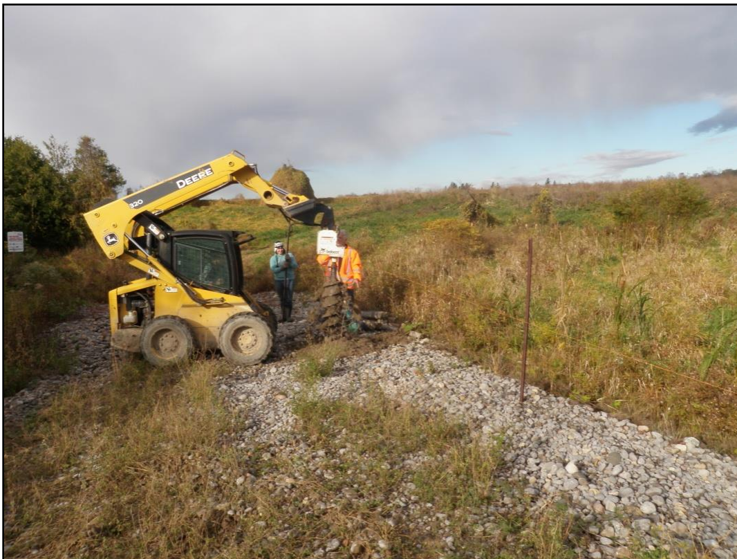
Figure 1: Old cattle fencing shown in photo and new hole being dug to place in new fence posts on the Barkey property.

The Barkey property is located in Pickering, Ontario and is a site of a previous restoration project. In 2007, cattle were fenced out of Duffins Creek and a low-level stream crossing was constructed for cattle and farm equipment. The fencing was in need of additional length and repair. On October 21 st , 2010, 11 volunteers completed a 9 m shoreline length of fencing on the Barkey property to exclude cattle from the creek.