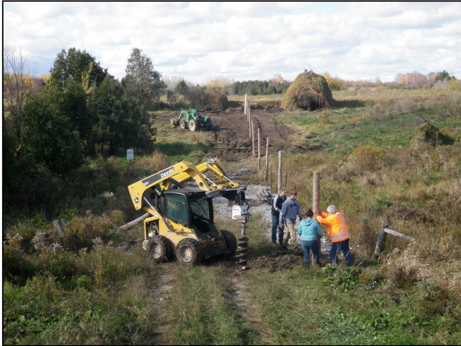
Figure 2: Volunteers placing new poles into the ground to exclude cattle from elsewhere in the stream.