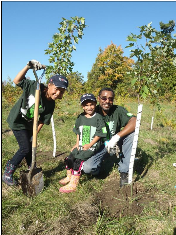
Figure 4: Picking family planting a tree.