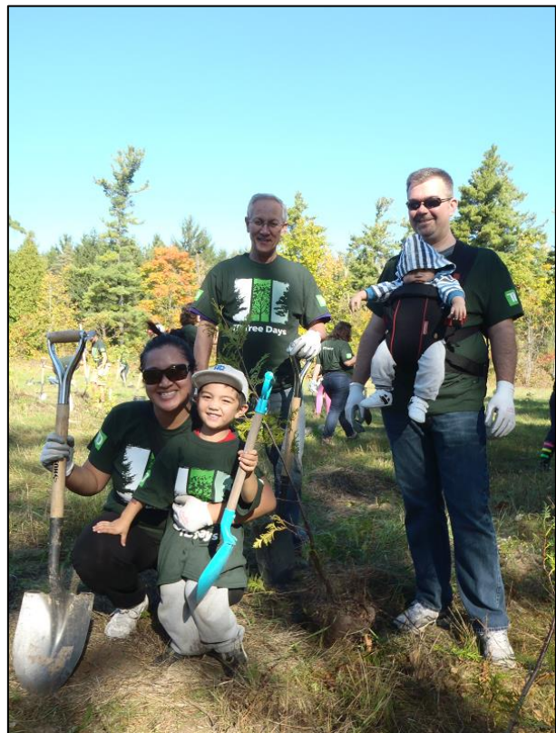
Figure 5: Family tree planting with the youngest volunteer.