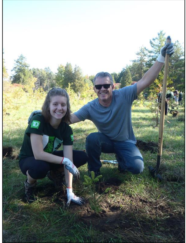
Figure 3: Picking TD Tree Day volunteers.