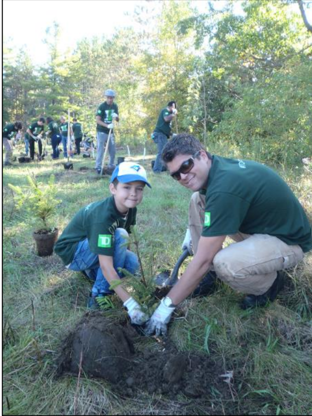
Figure 2: Picking TD Tree Day volunteers.