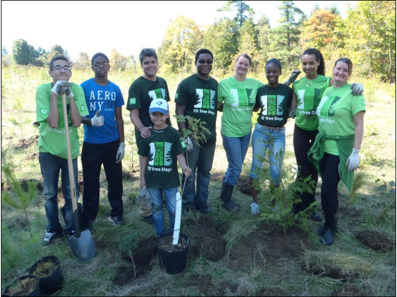
Figure 6: Group of volunteers that stayed to the end to plant the last trees.